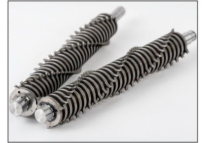
Aggressive cutting edges provide grip, and superior shredding performance.

The command dial controls power up, reverse, and continuous run functions.